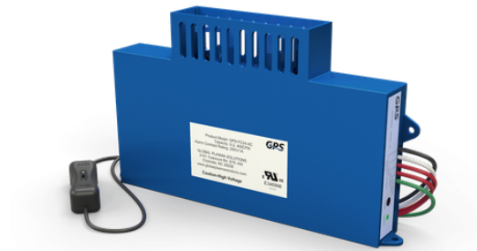
GPS-FC24™-AC Auto-Cleaning Soft Ionization System

GPS-FC-24-AC units were installed on the heat pump blower housing. Powered by the fan input, NPBI activates whenever the heat pump is running. Soft ionization is directed into the airflow for good distribution within the conditioned air. The NPBI device is silent, out of sight, and self-cleans for 10 years of operation without required maintenance.